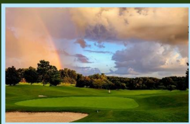
Woodmont Golf & Country Club Canton, GA