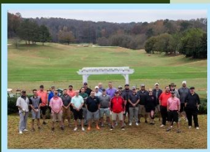
5th Annual Golf Tournament November 2020