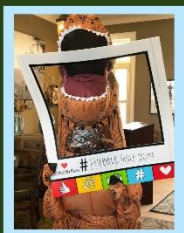
We have fun!!!