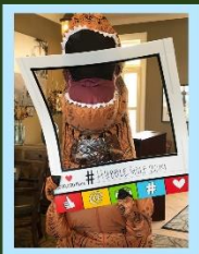
We have fun!!!