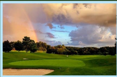
Woodmont Golf & Country Club Canton, GA